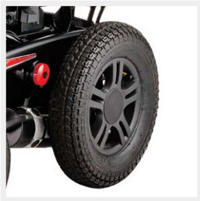
15" drive wheels