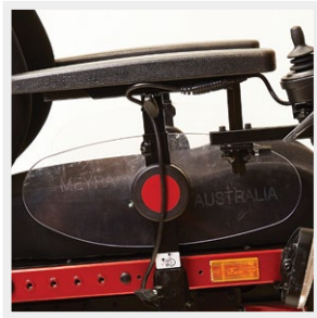
Side guard lighting with custom engraving