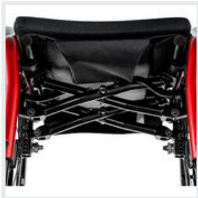
Double cross brace for rigid frame-like ride performance.