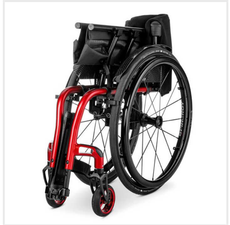
Convenient folding function for storage and travel.