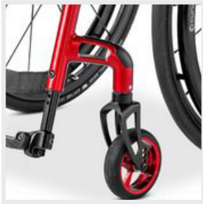
Castor wheel connection milled from solid material.